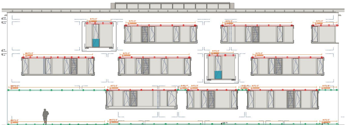
Installation-plan reference facade of the certified component (LC VI)